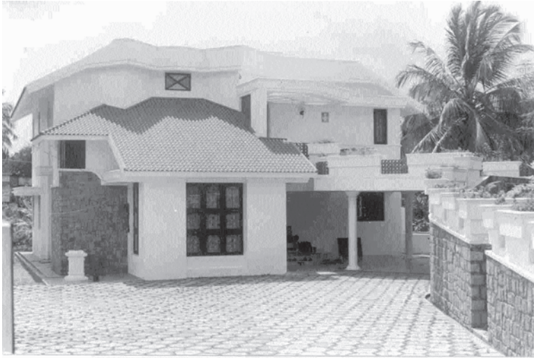
Look at this house 'Sukrutham' in a village in Kerala. It is located in Yakkar Village, 3 kilometres from Palakkad district town