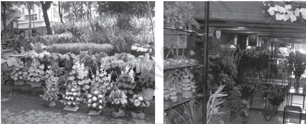
Farming of Flowers

as tomatoes and potatoes), which the companies then buy from them for processing or export. In such 'contract farming' systems, the company identifies the crop to be grown, provides the seeds and other inputs, as well as the know-how and often also the working capital. In return, the farmer is assured of a market because the company guarantees that it will purchase the produce at a predetermined fixed price. Contract farming is very common now in the production of specialised items such as cut flowers, fruits such as grapes, figs and pomegranates, cotton, and oilseeds. While contract farming appears to provide financial security to farmers, it can also lead to greater insecurity as farmers become dependent on these companies for their livelihoods. Contract farming of export-oriented products such as flowers and gherkins also means that agricultural land is diverted away from food grain production. Contract farming has sociological significance in that it disengages many people from the production process and makes their own indigenous knowledge of agriculture irrelevant. In addition, contract farming caters primarily to the production of elite items, and because it usually requires high doses of fertilisers and pesticides, it is often not ecologically sustainable.