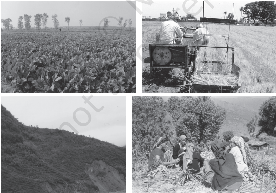
Cultivation in different parts of the country