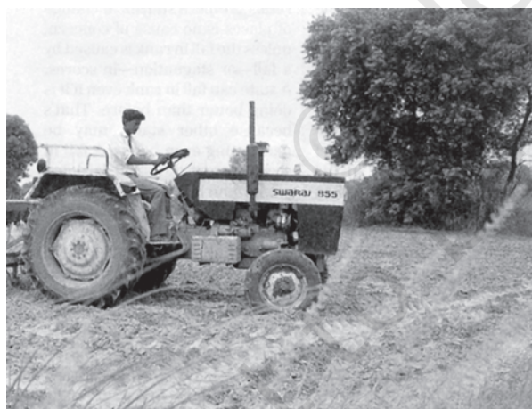
Changing technologies in agriculture