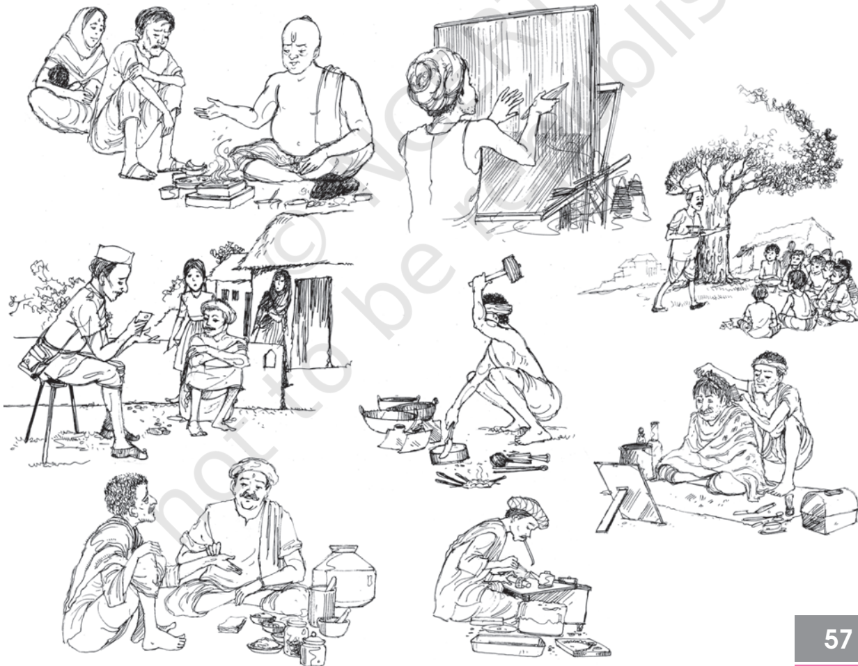
The Diversity of Occupations