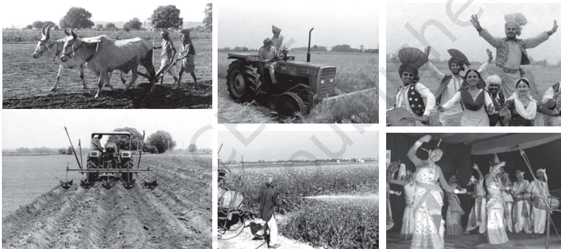
Different means of agriculture and related festivals.

Indian society is primarily a rural society though urbanisation is growing. The majority of India's people live in rural areas (67 per cent, according to the 2001 Census). They make their living from agriculture or related occupations. This means that agricultural land is the most important productive resource for a great many Indians. Land is also the most important form of property. But land is not just a 'means of production' nor just a 'form of property'. Nor is agriculture just a form of livelihood. It is also a way of life. Many of our cultural practices and patterns can be traced to our agrarian backgrounds. You will recall from the earlier chapters how closely interrelated structural and cultural changes are. For example, most of the New Year festivals in different regions of India – such as Pongal in Tamil Nadu, Bihu in Assam, Baisakhi in Punjab and Ugadi in Karnataka to name just a few – actually celebrate the main harvest season and herald the beginning of a new agricultural season. Find out about other harvest festivals.