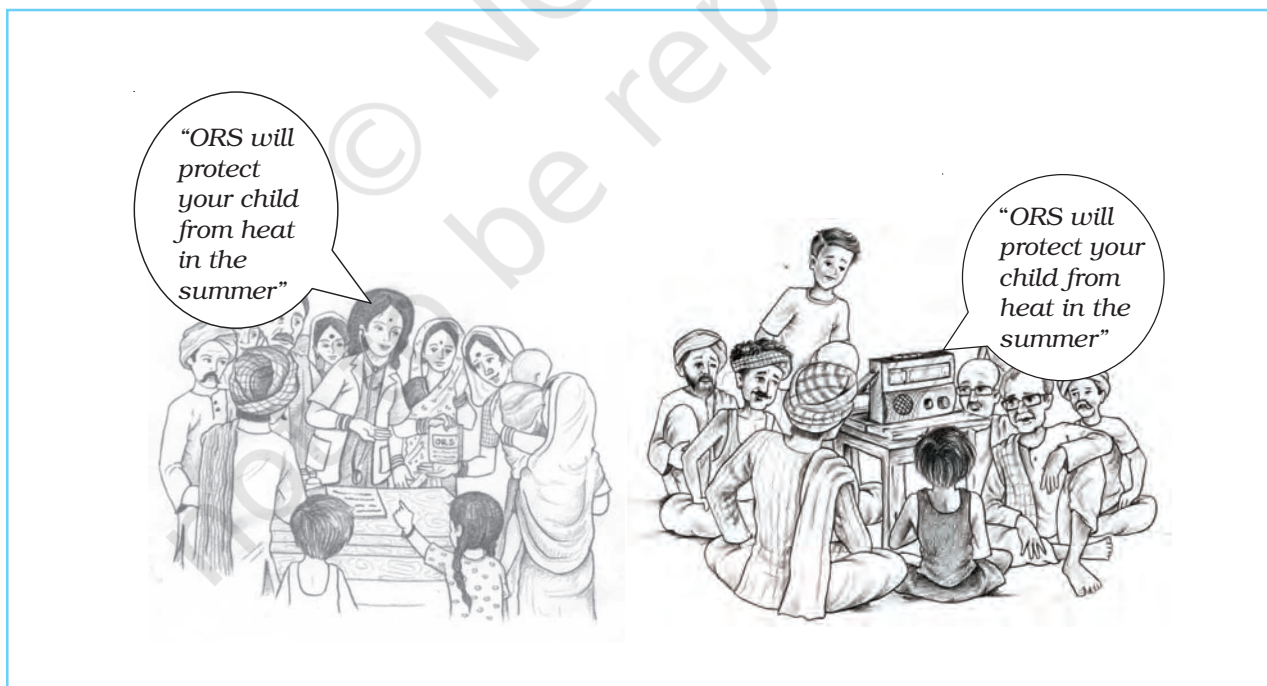
Fig.6.3 : Face-to-face Interaction versus Media Transmission. Which one works better? Why?

letters and pamphlets, or even through mass media. For example, a positive attitude towards Oral Rehydration Salts (ORS) for young children is more effectively created if community social workers and