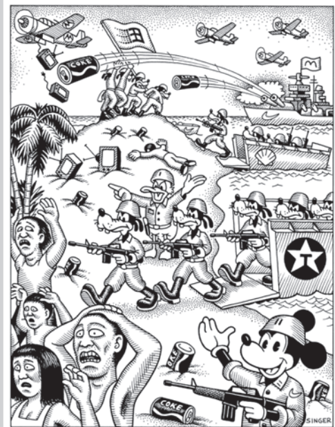
Invading new markets

The consequences of globalisation are not confined only to the sphere of politics and economy. Globalisation affects us in our home, in what we eat, drink, wear and indeed in what we think. It shapes what we think are our preferences. The cultural effect of globalisation leads to the fear that this process poses a threat to cultures in the world. It does so, because globalisation leads to the rise of a uniform culture or what is called cultural homogenisation. The rise of a uniform culture is not the emergence of a global culture. What we have in the name