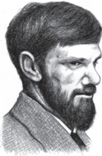
D.H. Lawrence 1885-1930

D.H. Lawrence was born in a coal-mining town. He was the son of an uneducated miner and an ambitious mother who was a teacher. His wife was German, and the couple lived, at various times, in Italy, Germany, Australia, Tahiti and Mexico. Lawrence's writings reflect a revolt against puritanism, mediocrity and the dehumanisation of an industrial society.