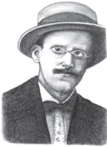
James Joyce 1882-1941

James Joyce is a major literary figure of the first quarter of the twentieth century. He is known for his bold experiments in narrative techniques in fiction, and Ulysses is his most famous work. 'Eveline' is one of the fifteen stories of Dublin life that form Dubliners, first published in 1914. It is a sympathetic portrayal of Eveline, who has within her reach escape from the drudgery of her life but cannot gather enough courage to seize it.