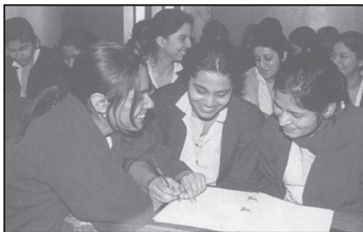
Contrast the two types of groups.