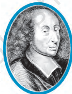
Blaise Pascal (1623-1662)

In earlier classes, we have learnt how to find the squares and cubes of binomials like a + b and a - b . Using them, we could evaluate the numerical values of numbers like (98)^2 = (100 - 2)^2 , (999)^3 = (1000 - 1)^3 , etc. However, for higher powers like (98)^5 , (101)^6 , etc., the calculations become difficult by using repeated multiplication. This difficulty was overcome by a theorem known as binomial theorem. It gives an easier way to expand (a + b)^n , where n is an integer or a rational number. In this Chapter, we study binomial theorem for positive integral indices only.