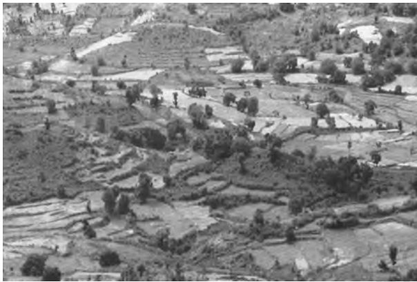
Figure 6.6 : Terrace Farming

for cultivation. If at all the land is to be used for agriculture, terraces should carefully be made. Over-grazing and shifting cultivation in many parts of India have affected the natural cover of land and given rise to extensive erosion. It should be regulated and controlled by educating villagers about the consequences. Contour bunding, Contour terracing, regulated forestry, controlled grazing, cover cropping, mixed farming and crop rotation are some of the remedial measures which are often adopted to reduce soil erosion.