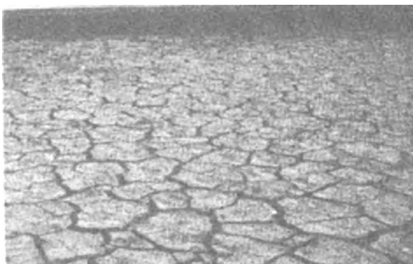
Figure 6.3 : Black Soil During Dry Season

western part of the Deccan Plateau, the black soil is very deep. These soils are also known as the 'Regur Soil' or the 'Black Cotton Soil'. The black soils are generally clayey, deep and impermeable. They swell and become sticky when wet and shrink when dried. So, during the dry season, these soil develop wide cracks. Thus, there occurs a kind of 'self ploughing'. Because of this character of slow absorption and loss of moisture, the black soil retains the moisture for a very long time, which helps the crops, especially, the rain fed ones, to sustain even during the dry season.