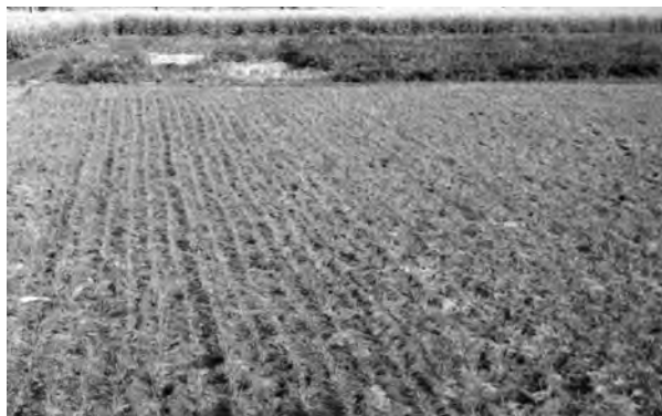
Figure 6.1 : Alluvial Soil

about 40 per cent of the total area of the country. They are depositional soils, transported and deposited by rivers and streams. Through a narrow corridor in Rajasthan, they extend into the plains of Gujarat. In the Peninsular region, they are found in deltas of the east coast and in the river valleys.