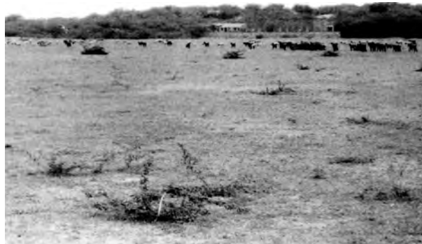
Figure 6.4 : Arid Soil

Arid soils range from red to brown in colour. They are generally sandy in structure and saline in nature. In some areas, the salt content is so high that common salt is obtained by evaporating the saline water. Due to the dry climate, high temperature and accelerated evaporation, they lack moisture and humus. Nitrogen is insufficient and the phosphate