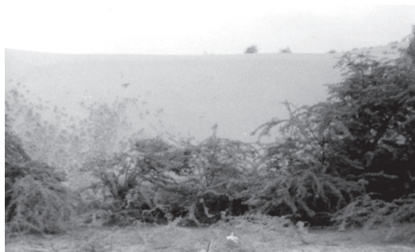
Figure 5.4 : Tropical Thorn Forests

Tropical thorn forests occur in the areas which receive rainfall less than 50 cm. These consist of a variety of grasses and shrubs. It includes semi-arid areas of south west Punjab, Haryana, Rajasthan, Gujarat, Madhya Pradesh and Uttar Pradesh. In these forests, plants remain leafless for most part of the year and give an expression of scrub vegetation. Important species found are babool , ber , and wild date palm, khair , neem , khejri , palas , etc. Tussocky grass grows upto a height of 2 m as the under growth.