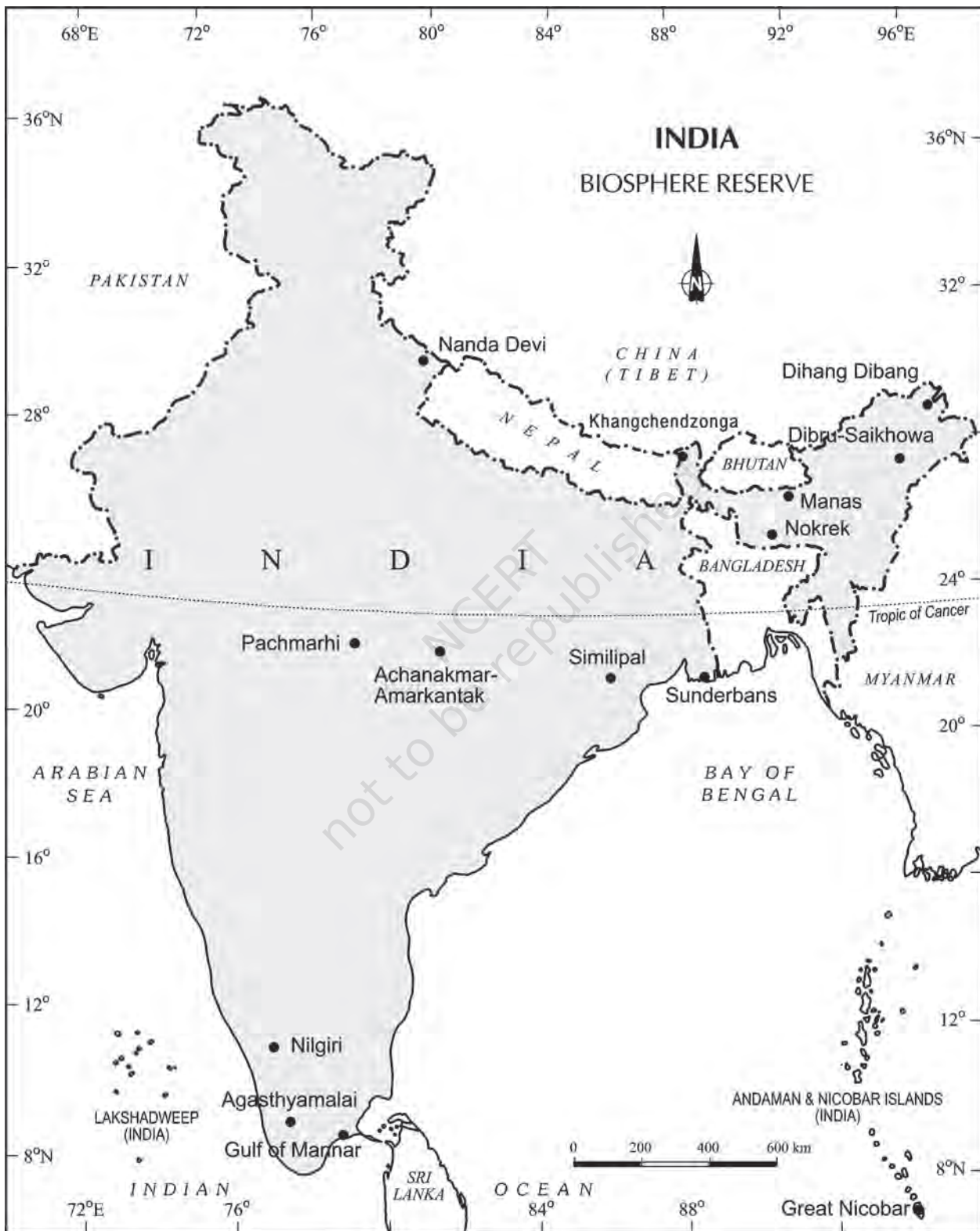
Figure 5.9 : India : Biosphere Reserves