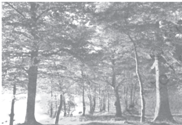
Figure 5.3 : Deciduous Forests

These are the most widespread forests in India. They are also called the monsoon forests. They spread over regions which receive rainfall between 70-200 cm. On the basis of the availability of water, these forests are further divided into moist and dry deciduous.