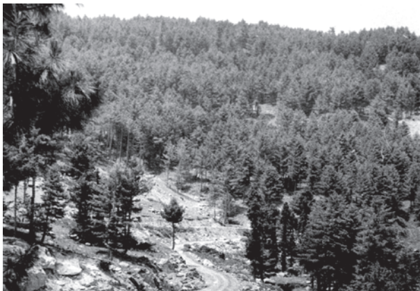
Figure 5.5 : Montane Forests

The Himalayan ranges show a succession of vegetation from the tropical to the tundra, which change in with the altitude. Deciduous forests are found in the foothills of the Himalayas. It is succeeded by the wet temperate type of forests between an altitude of 1,000-2,000 m. In the higher hill ranges of northeastern India, hilly areas of West Bengal and Uttaranchal, evergreen broad leaf trees such as oak and chestnut are predominant. Between 1,500-1,750 m, pine forests are also well-developed in this zone, with Chir Pine as a very useful commercial tree. Deodar, a highly valued endemic species grows mainly in the western part of the Himalayan range. Deodar is a durable wood mainly used in construction activity. Similarly, the chinar and the walnut, which sustain the famous Kashmir handicrafts, belong to this zone. Blue pine and spruce appear at altitudes of 2,225-3,048 m. At many places in this zone, temperate grasslands are also found. But in the higher reaches there is a transition to Alpine forests and pastures. Silver firs, junipers, pines, birch and rhododendrons, etc. occur between 3,000-4,000 m. However, these pastures are used extensively for transhumance by tribes like the Gujjars, the Bakarwals, the Bhotiyas and the Gaddis. The southern slopes of the Himalayas carry a thicker vegetation cover because of relatively higher precipitation than the drier north-facing slopes. At higher altitudes, mosses and lichens form part of the tundra vegetation.