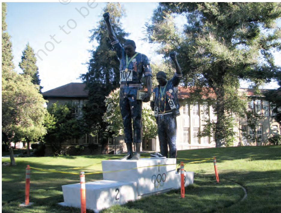
In 2005, the San Jose State University installed a 20-foot high sculpture representing the protest by Tommie Smith and John Carlos. A photograph of the original medal ceremony in 1968 is on the top.

Do you think that Carlos and Smith should have raised an internal matter of American society in an international forum? Would you say that what they did was political? Why do you think Peter Norman, who was neither Black nor American, joined in the gesture of protest? If you were in Norman's place what would you do?