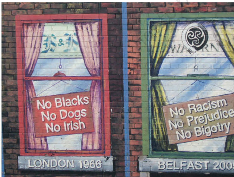
In some societies of Northern Ireland, the colonies of Protestant and Catholic communities are divided by walls. These walls are sometimes filled with graffiti as you can see here. The Irish Republican Army and British Government signed an agreement in 2005. What does the graffiti here tell about the conflict in the society?

Second, it depends on how political leaders raise the demands of any community. It is easier to accommodate demands that are within the constitutional framework and are not at the cost of another community.