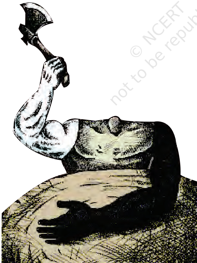
© Ares - Cagle Cartoons Inc.

It is fairly common for people belonging to the same religion to feel that they do not belong to the same community, because their caste or sect is very different. It is also possible for people from different religions to have the same caste and feel close to each other. Rich and poor persons from the same family often do not keep close relations with each other for they feel they are very different. Thus, we all have more than one identity and can belong to more than one social group. We have different identities in different contexts.