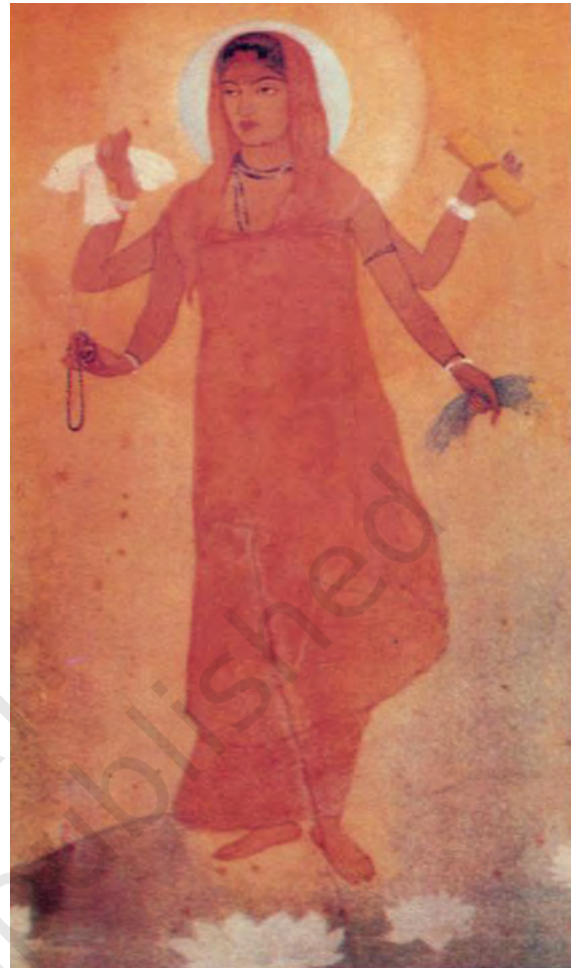
Fig. 12 – Bharat Mata, Abanindranath Tagore, 1905. Notice that the mother figure here is shown as dispensing learning, food and clothing. The mala in one hand emphasises her ascetic quality. Abanindranath Tagore, like Ravi Varma before him, tried to develop a style of painting that could be seen as truly Indian.

Ideas of nationalism also developed through a movement to revive Indian folklore. In late-nineteenth-century India, nationalists began recording folk tales sung by bards and they toured villages to gather folk songs and legends. These tales, they believed, gave a true picture of traditional culture that had been corrupted and damaged by outside forces. It was essential to preserve this folk tradition in order to discover one’s national identity and restore a sense of pride in one’s past. In Bengal, Rabindranath Tagore himself began collecting ballads, nursery rhymes and myths, and led the movement for folk