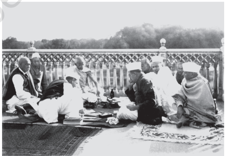
Fig. 6 – Meeting of Congress leaders at Allahabad, 1931. Apart from Mahatma Gandhi, you can see Sardar Vallabhbhai Patel (extreme left), Jawaharlal Nehru (extreme right) and Subhas Chandra Bose (fifth from right).

Lala Lajpat Rai was assaulted by the British police during a peaceful demonstration against the Simon Commission. He succumbed to injuries that were inflicted on him during the demonstration.