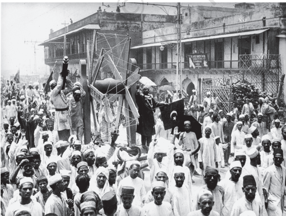
Fig. 4 – The boycott of foreign cloth, July 1922. Foreign cloth was seen as the symbol of Western economic and cultural domination.

Boycott – The refusal to deal and associate with people, or participate in activities, or buy and use things; usually a form of protest