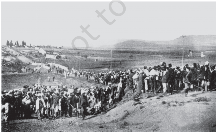
Fig. 2 – Indian workers in South Africa march through Volksrust, 6 November 1913.

Forced recruitment – A process by which the colonial state forced people to join the army