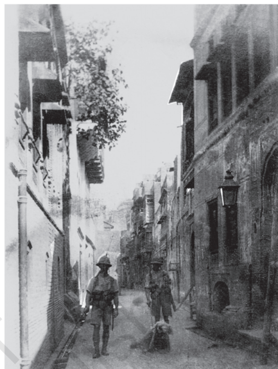
Fig. 3 – General Dyer's 'crawling orders' being administered by British soldiers, Amritsar, Punjab, 1919.

In his famous book Hind Swaraj (1909) Mahatma Gandhi declared that British rule was established in India with the cooperation of