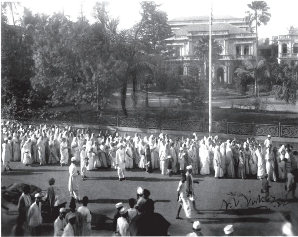
Fig. 9 – Women join nationalist processions. During the national movement, many women, for the first time in their lives, moved out of their homes on to a public arena. Amongst the marchers you can see many old women, and mothers with children in their arms.

picketed foreign cloth and liquor shops. Many went to jail. In urban areas these women were from high-caste families; in rural areas they came from rich peasant households. Moved by Gandhiji's call, they began to see service to the nation as a sacred duty of women. Yet, this increased public role did not necessarily mean any radical change in the way the position of women was visualised. Gandhiji was convinced that it was the duty of women to look after home and hearth, be good mothers and good wives. And for a long time the Congress was reluctant to allow women to hold any position of authority within the organisation. It was keen only on their symbolic presence.