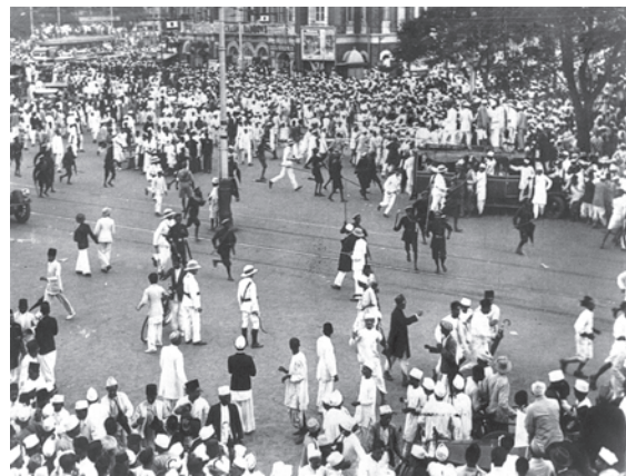
Fig. 8 – Police cracked down on satyagrahis, 1930.

In such a situation, Mahatma Gandhi once again decided to call off the movement and entered into a pact with Irwin on 5 March 1931. By this Gandhi-Irwin Pact, Gandhiji consented to participate in a Round Table Conference (the Congress had boycotted the first