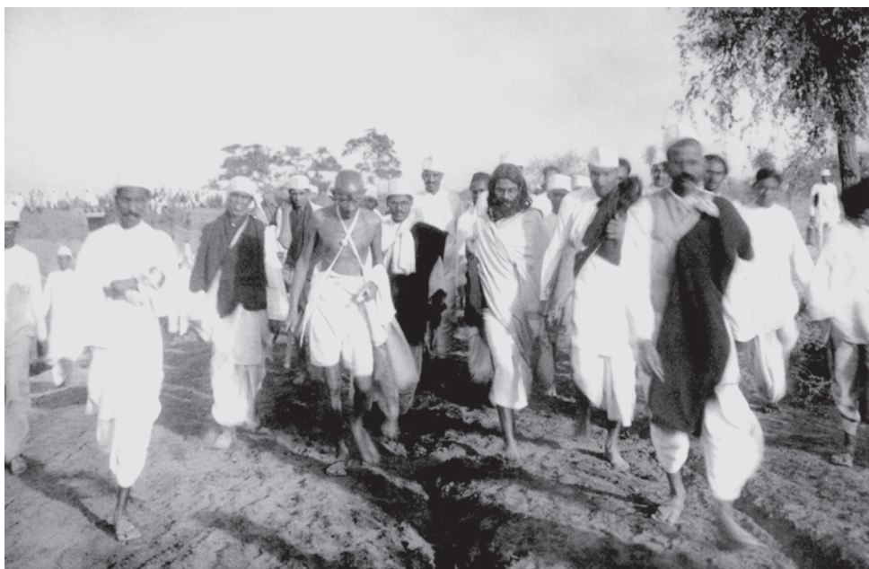
Fig. 7 – The Dandi march. During the salt march Mahatma Gandhi was accompanied by 78 volunteers. On the way they were joined by thousands.

with the British, as they had done in 1921-22, but also to break colonial laws. Thousands in different parts of the country broke the salt law, manufactured salt and demonstrated in front of government salt factories. As the movement spread, foreign cloth was boycotted, and liquor shops were picketed. Peasants refused to pay revenue and chankidari taxes, village officials resigned, and in many places forest people violated forest laws – going into Reserved Forests to collect wood and graze cattle.