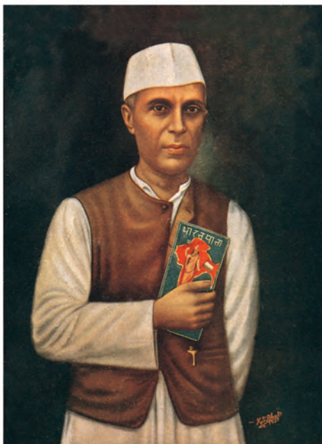
Fig. 13 – Jawaharlal Nehru, a popular print. Nehru is here shown holding the image of Bharat Mata and the map of India close to his heart. In a lot of popular prints, nationalist leaders are shown offering their heads to Bharat Mata. The idea of sacrifice for the mother was powerful within popular imagination.