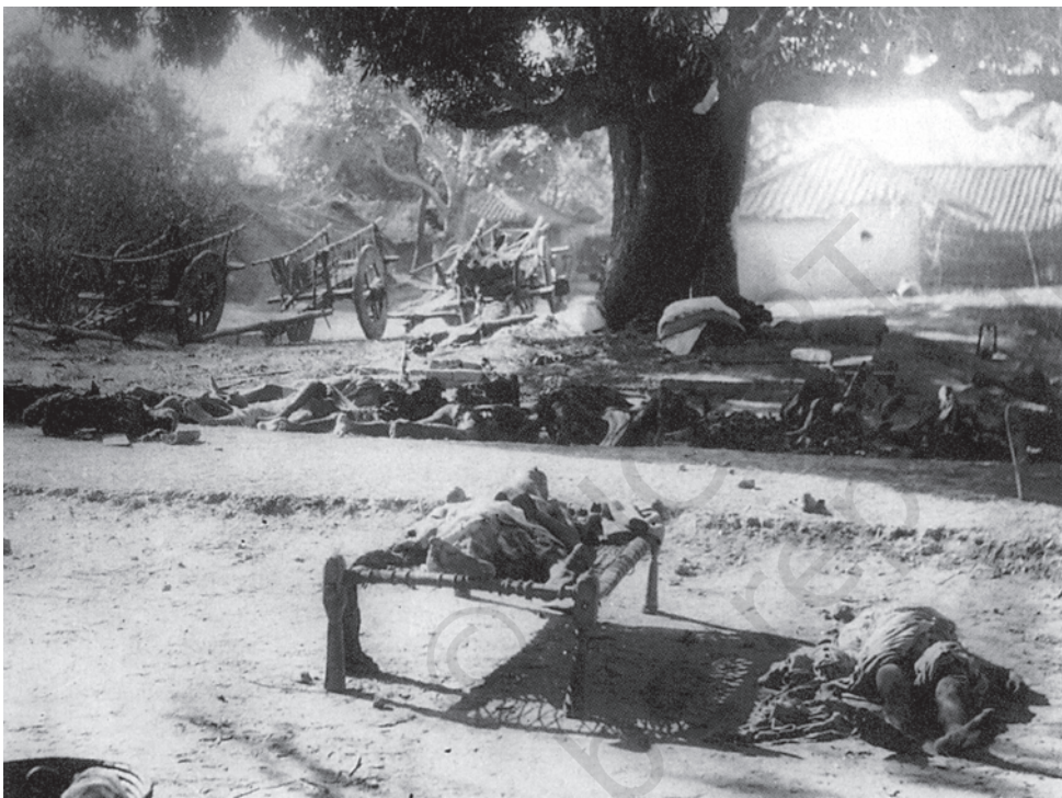
Fig. 5 – Chauri Chaura, 1922.

The visions of these movements were not defined by the Congress programme. They interpreted the term swaraj in their own ways, imagining it to be a time when all suffering and all troubles would be over. Yet, when the tribals chanted Gandhiji's name and raised slogans demanding ' Swatantra Bharat ', they were also emotionally relating to an all-India agitation. When they acted in the name of Mahatma Gandhi, or linked their movement to that of the Congress, they were identifying with a movement which went beyond the limits of their immediate locality.