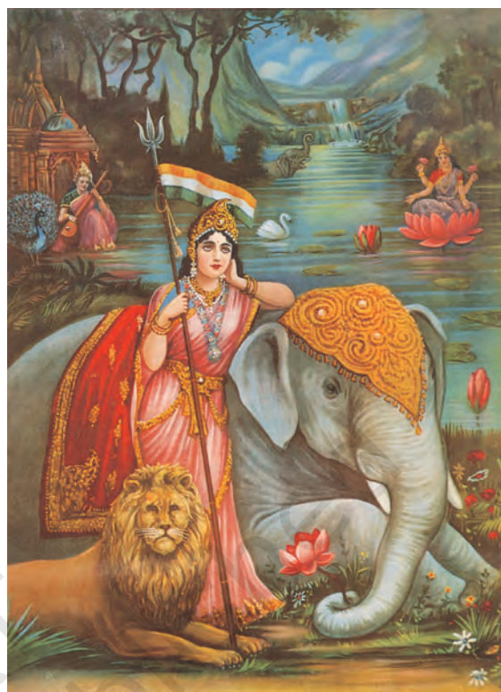
Fig. 14a – Bharat Mata.

This figure of Bharat Mata is a contrast to the one painted by Abanindranath Tagore. Here she is shown with a trishul, standing beside a lion and an elephant – both symbols of power and authority.