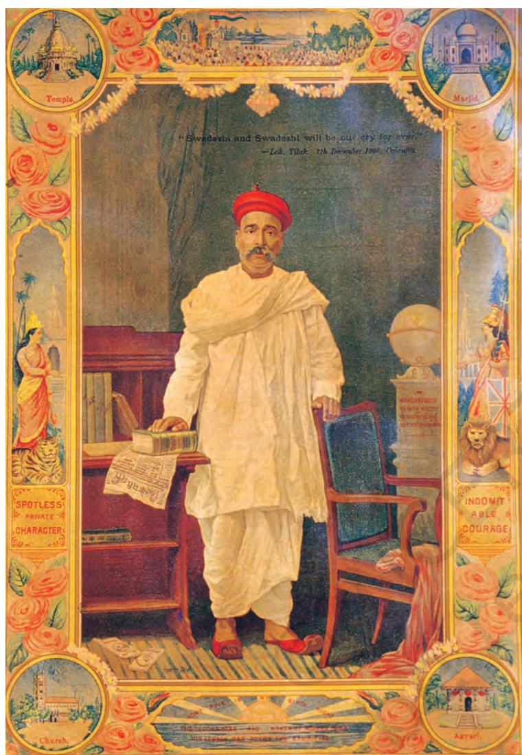
Fig. 11 – Bal Gangadhar Tilak, an early-twentieth-century print. Notice how Tilak is surrounded by symbols of unity. The sacred institutions of different faiths (temple, church, masjid) frame the central figure.

Nationalism spreads when people begin to believe that they are all part of the same nation, when they discover some unity that binds them together. But how did the nation become a reality in the minds of people? How did people belonging to different communities, regions or language groups develop a sense of collective belonging?