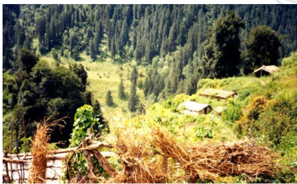
Figure 16.2 A view of a forest life

Do you think such use of forest resources would lead to the exhaustion of these resources? Do not forget that before the British came and took over most of our forest areas, people had been living in these forests for centuries. They had developed practices to ensure that the resources were used in a sustainable manner. After the British took control of the forests (which they exploited ruthlessly for their own purposes), these people were forced to depend on much smaller areas and forest resources started becoming over-exploited to some extent. The Forest Department in independent India took over from the British but local knowledge and local needs continued to be ignored in the management practices. Thus vast tracts of forests have been converted to monocultures of pine, teak or eucalyptus. In order to plant these trees, huge areas are first cleared of all vegetation. This destroys a large amount of biodiversity in the area. Not only this, the varied needs of the local people – leaves for fodder, herbs for medicines, fruits and nuts for food – can no longer be met from such forests. Such plantations are useful for the industries to access specific products and are an important source of revenue for the Forest Department.