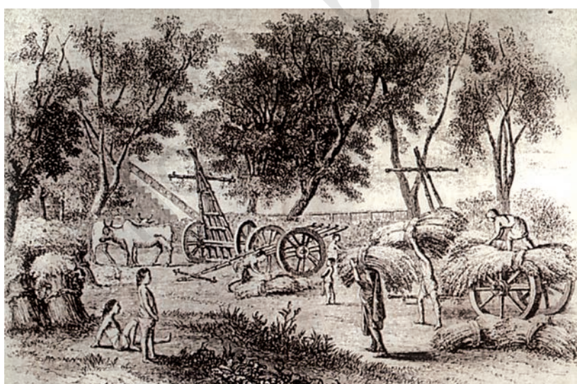
Fig. 9 – The Indigo plant being brought from the fields to the factory

In India the indigo plant was cut mostly by men.