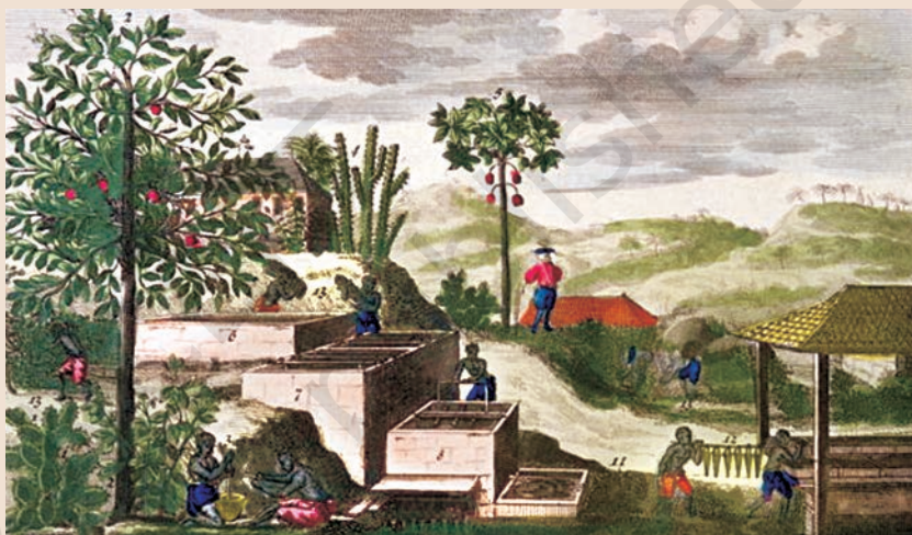
Fig. 14 – Making indigo in a Caribbean slave plantation

You can see the slave workers putting the indigo plant into the settler vat on the left. Another worker is churning the liquid with a mechanical churner in a vat (second from right). Two workers are carrying the indigo pulp hung up in bags to be dried. In the foreground two others are mixing the indigo pulp to be put into moulds. The planter is at the centre of the picture standing on the high ground supervising the slave workers.