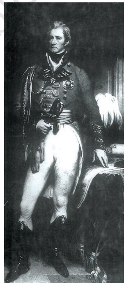
Fig. 4 – Thomas Munro, Governor of Madras (1819-26)

Mahal – In British revenue records mahal is a revenue estate which may be a village or a group of villages.