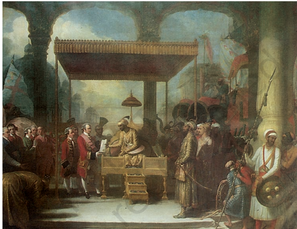
Fig. 1 – Robert Clive accepting the Diwani of Bengal, Bihar and Orissa from the Mughal ruler in 1765