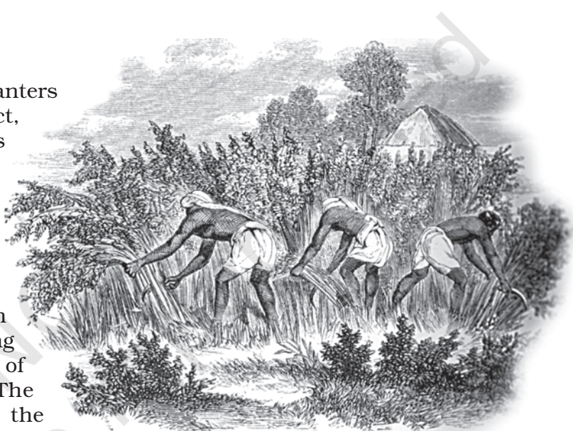
Fig. 8 – Workers harvesting indigo in early-nineteenth-century Bengal. From Colesworthy Grant, Rural Life in Bengal , 1860

Bigha – A unit of measurement of land. Before British rule, the size of this area varied. In Bengal the British standardised it to about one-third of an acre.