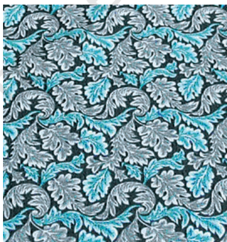
Fig. 6 – A Morris cotton print, late-nineteenth-century England