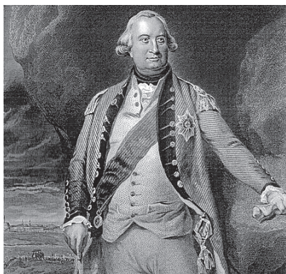
Fig. 3 – Charles Cornwallis Cornwallis was the Governor-General of India when the Permanent Settlement was introduced.