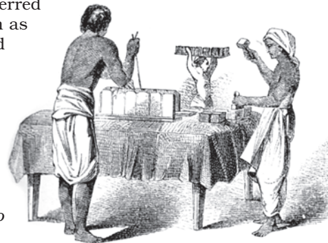
Fig. 13 – The indigo is ready for sale

the indigo pulp – transferred to another vat (known as the settling vat), and then pressed and dried for sale.