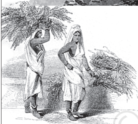
Fig. 11 – Women usually carried the indigo plant to the vats.