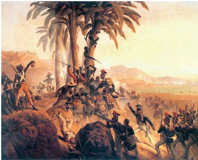
Fig. 7 – The Slave Revolt in St Domingue, August 1791 , painting by January Scuhodolski

In the eighteenth century, French planters produced indigo and sugar in the French colony of St Domingue in the Caribbean islands. The African slaves who worked on the plantations rose in rebellion in 1791, burning the plantations and killing their rich planters. In 1792 France abolished slavery in the French colonies. These events led to the collapse of the indigo plantations on the Caribbean islands.