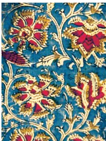
Fig. 5 – A kalamkari print, twentieth-century India

How was this done? The British used a variety of methods to expand the cultivation of crops that they needed. Let us take a closer look at the story of one such crop, one such method of production.