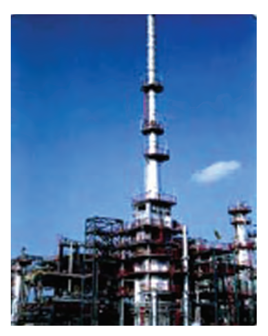
Fig. 5.5: A petroleum refinery

separating the various constituents/ fractions of petroleum is known as refining. It is carried out in a petroleum refinery (Fig. 5.5).