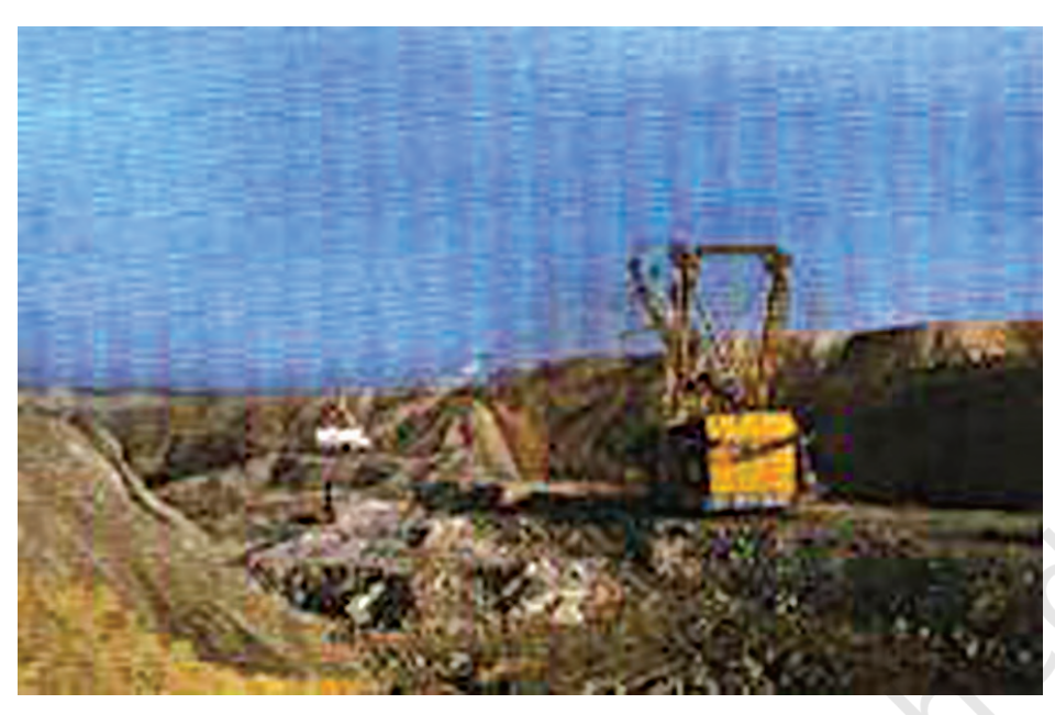
Fig. 5.2: A coal mine

When heated in air, coal burns and produces mainly carbon dioxide gas.