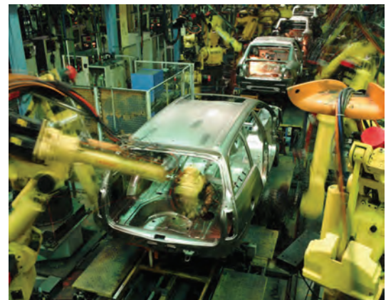
A car being put together in a factory.

We have also examined the chain of markets that is formed before goods can reach us. It is through