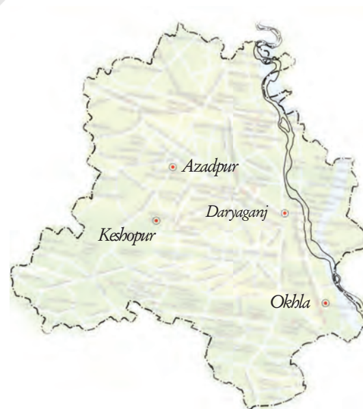
The above map of Delhi shows four of the 10 wholesale markets in the city.