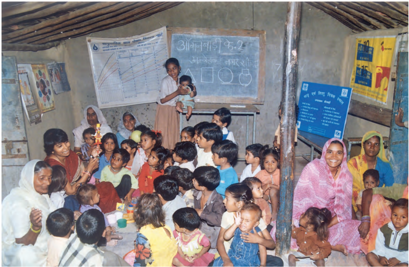
Children at an Anganwadi centre in a village in Madhya Pradesh.

This naturally has an impact on whether girls can attend school. It determines whether women can work outside the house and what kind of jobs and careers they can have. The government has set up anganwadis or child-care centres in several villages in the country. The government has passed laws that make it mandatory for organisations that have more than 30 women employees to provide crèche facilities. The provision of crèches helps many women to take up employment outside the home. It also makes it possible for more girls to attend schools.