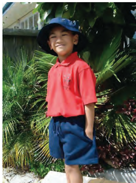
A Class VII Samoan child in his school uniform.

From Class VI onwards, boys and girls went to separate schools. The girls' school was designed very differently from the boys' school. They had a central courtyard where they played in total seclusion and