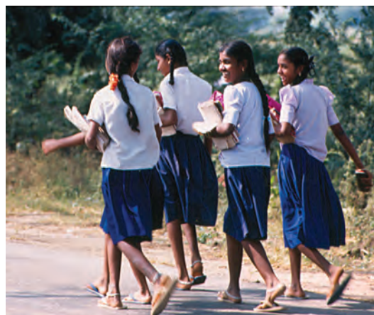
Why do girls like to go to school together in groups?

In what ways do the experiences of Samoan children and teenagers differ from your own experiences of growing up? Is there anything in this experience that you wish was part of your growing up?