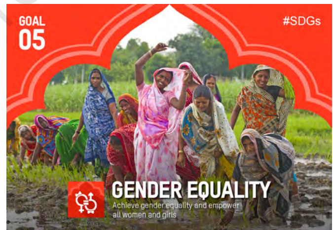
Sustainable Development Goal (SDG) www.in.undp.org

This naturally has an impact on whether girls can attend school. It determines whether women can work outside the house and what kind of jobs and careers they can have. The government has set up anganwadis or child-care centres in several villages in the country. The government has passed laws that make it mandatory for organisations that have more than 30 women employees to provide crèche facilities. The provision of crèches helps many women to take up employment outside the home. It also makes it possible for more girls to attend schools.