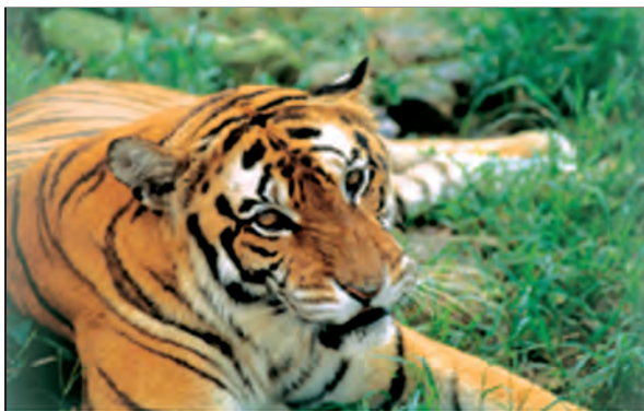
Fig. 8.14: Tiger in Manas Wildlife sanctuary

All the four ways of transport are well developed in the Ganga-Brahmaputra basin. In the plain areas the roadways and railways transport the people from one place to another. The waterways, is an effective means of transport particularly along the rivers. Kolkata is an important port on the River Hooghly. The plain area also has a large number of airports.