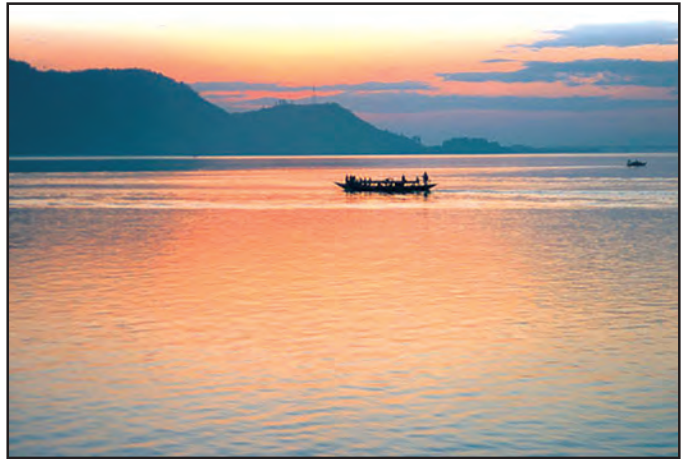
Fig. 8.7 Brahmaputra river

The tributaries of rivers Ganga and Brahmaputra together form the Ganga-Brahmaputra basin in the Indian subcontinent (Fig. 8.8). The basin lies in the sub-tropical region that is situated between 10°N to 30°N latitudes. The tributaries of the River Ganga like the Ghaghra, the Son, the Chambal, the Gandak, the Kosi and the tributaries of Brahmaputra drain it. Look at the atlas and find names of some tributaries of the River Brahmaputra.