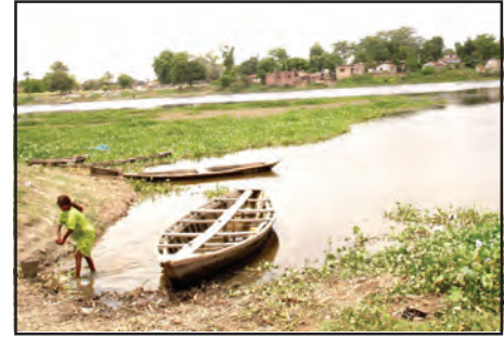
A Polluted Lake

to sell in the market. They have even begun supply to the neighbouring town. The community is living in harmony with nature. As long as the pollutants from nearby towns do not find their way into the lake waters, the fish cultivation will not face any threat.