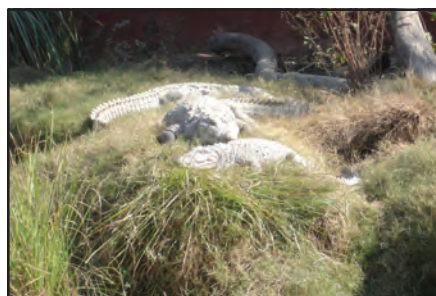
Fig. 8.12 : Crocodiles