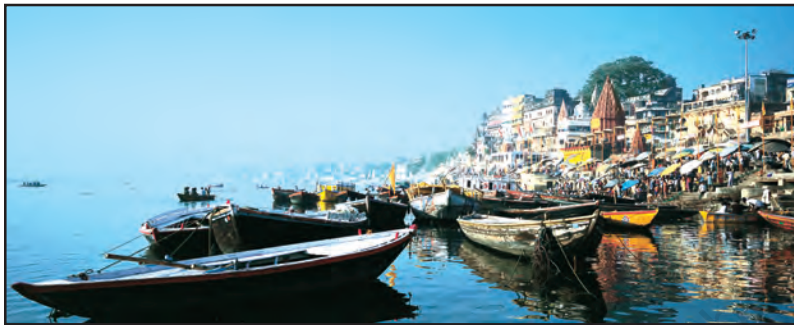
Fig. 8.13: Varanasi along the River Ganga

The Ganga-Brahmaputra plain has several big towns and cities. The cities of Allahabad, Kanpur, Varanasi, Lucknow, Patna and Kolkata all with the population of more than ten lakhs are located along the River Ganga (Fig. 8.13). The wastewater from these towns