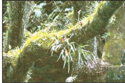
Fig. 8.3 : The Amazon Forest

As it rains heavily in this region, thick forests grow (Fig. 8.3). The forests are in fact so thick that the dense “roof” created by leaves and branches does not allow the sunlight to reach the ground. The ground remains dark and damp. Only shade tolerant vegetation may grow here. Orchids, bromeliads grow as plant parasites.