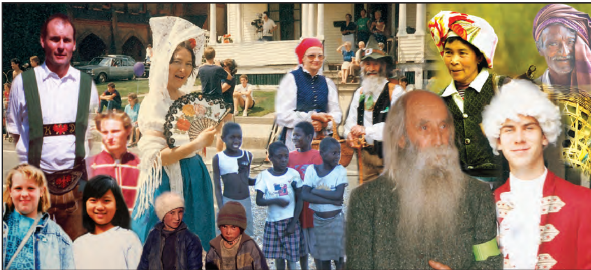
Fig. 8.1: People from various parts of the world