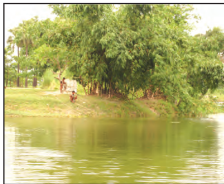
A clean lake

Binod is a fisherman living in the Matwali Maun village of Bihar. He is a happy man today. With the efforts of the fellow fishermen – Ravindar, Kishore, Rajiv and others, he cleaned the maun or the ox-bow lake to cultivate different varieties of fish. The local weed (vallineria, hydrilla) that grows in the lake is the food of the fish. The land around the lake is fertile. He sows crops such as paddy, maize and pulses in these fields. The buffalo is used to plough the land. The community is satisfied. There is enough fish catch from the river – enough fish to eat and enough fish