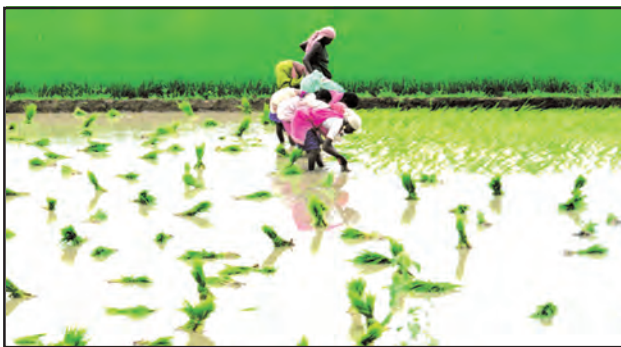
Fig. 8.9 : Paddy Cultivation

The vegetation cover of the area varies according to the type of landforms. In the Ganga and Brahmaputra plain tropical deciduous trees grow, along with teak, sal and peepal. Thick bamboo groves are common in the Brahmaputra plain. The delta area is covered with the