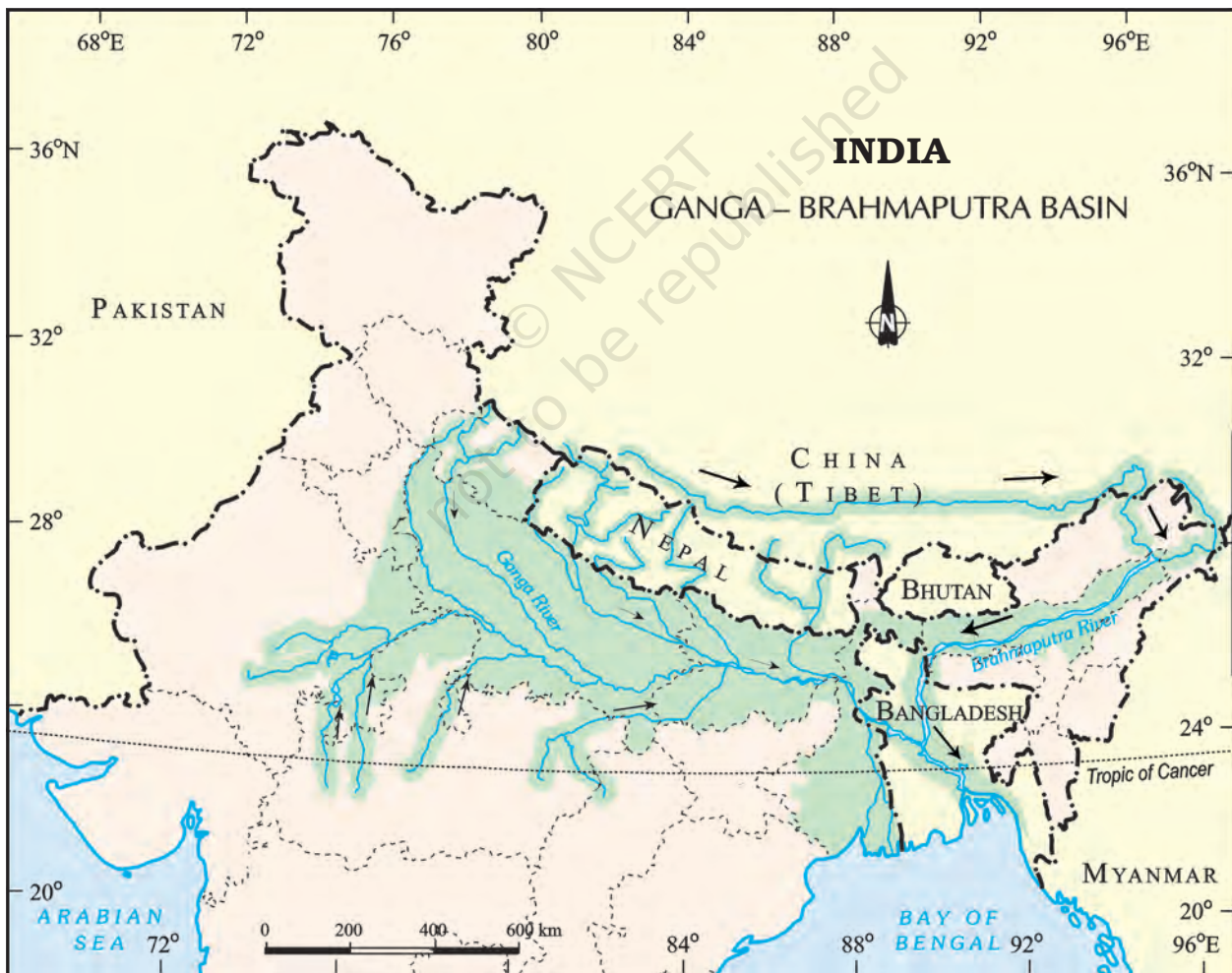
Fig. 8.8: Ganga-Brahmaputra Basin

The plains of the Ganga and the Brahmaputra, the mountains and the foothills of the