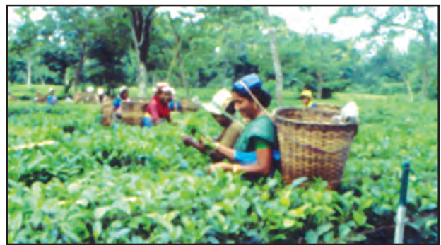
Fig. 8.10 : Tea Garden in Assam