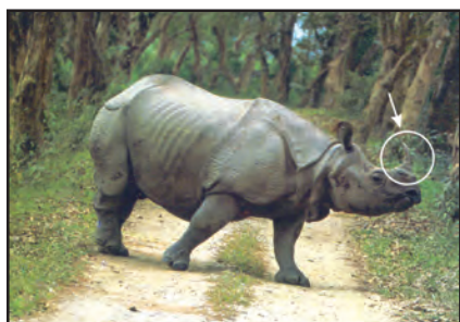
Fig. 8.11 : One horned rhinoceros

There is a variety of wildlife in the basin. Elephants, tigers, deer and monkeys are common. The one-horned rhinoceros is found in the Brahmaputra plain. In the delta area, Bengal tiger, crocodiles and alligator are found. Aquatic life abounds in the fresh river waters, the lakes and the Bay of Bengal Sea. The most popular varieties of the fish are the rohu, catla and hilsa. Fish and rice is the staple diet of the people living in the area.