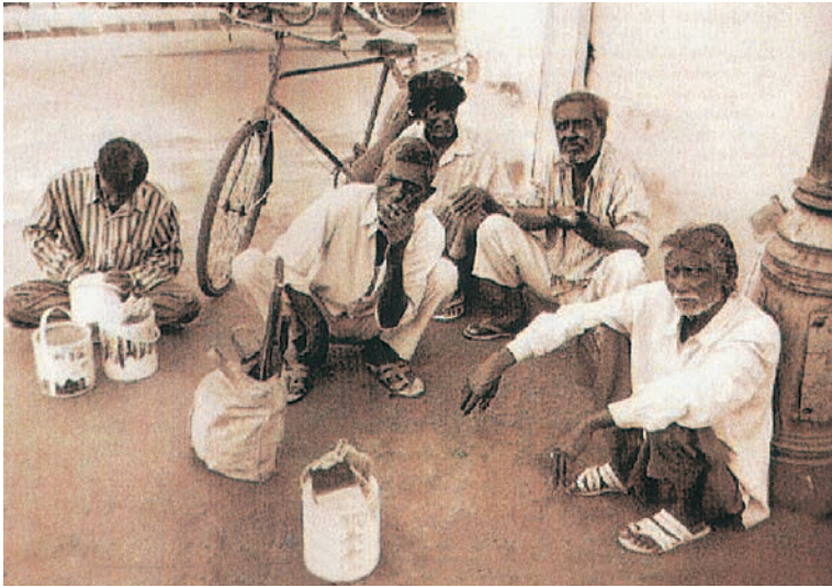
At labour chowk, daily wage workers wait with their tools for people to come and take them for work.

trucks in the market, dig pipelines and telephone cables and also build roads. There are thousands of such casual workers in the city.